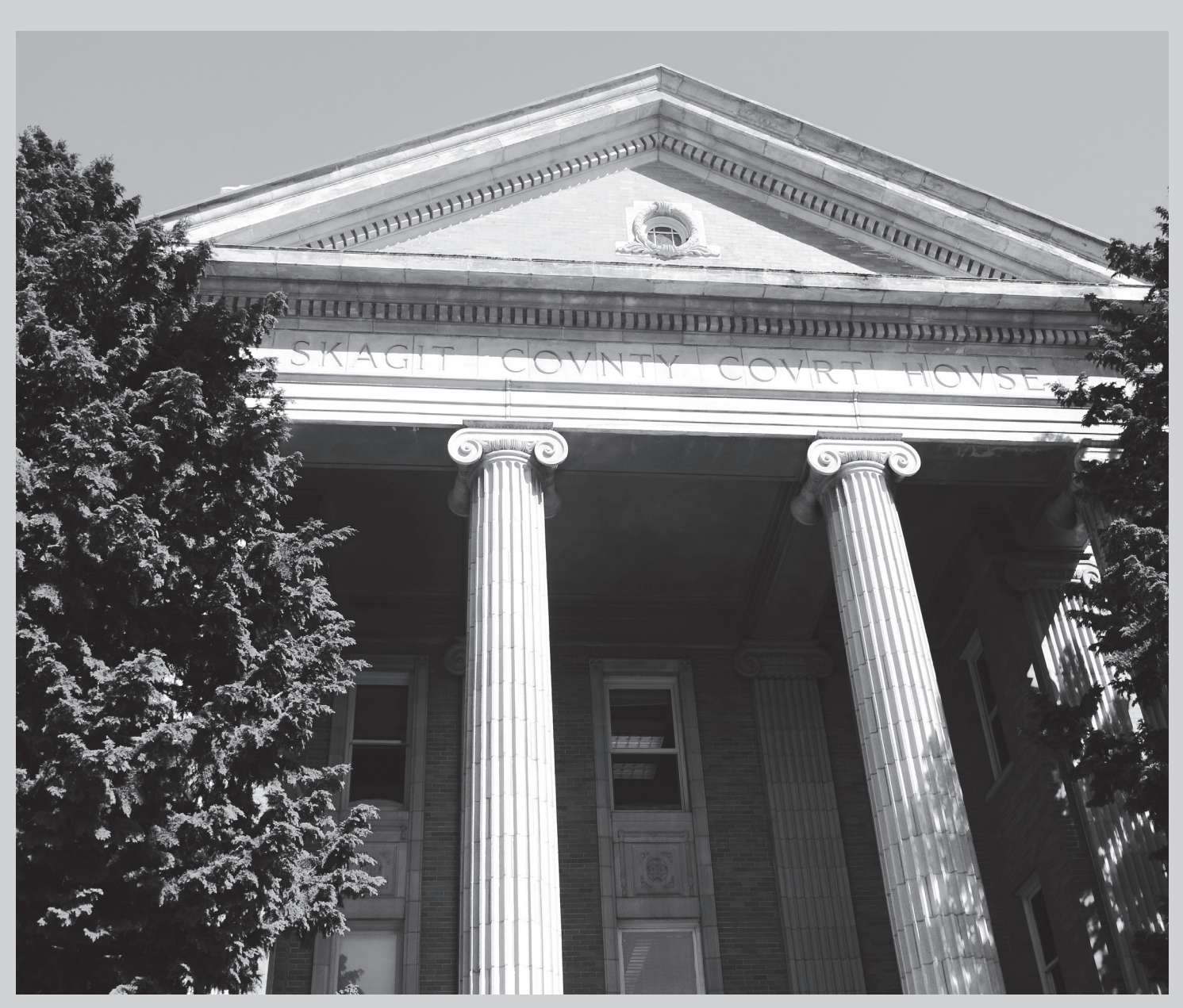
Published by the Skagit County Auditor